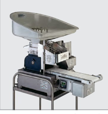
Super Portioning Machine with Programmable Counter and Conveyor

For more information contact Hollymatic or your local authorized Hollymatic Dealer today!